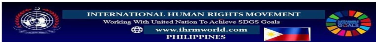
Figure 1. Letter sent to Prime Water Subic